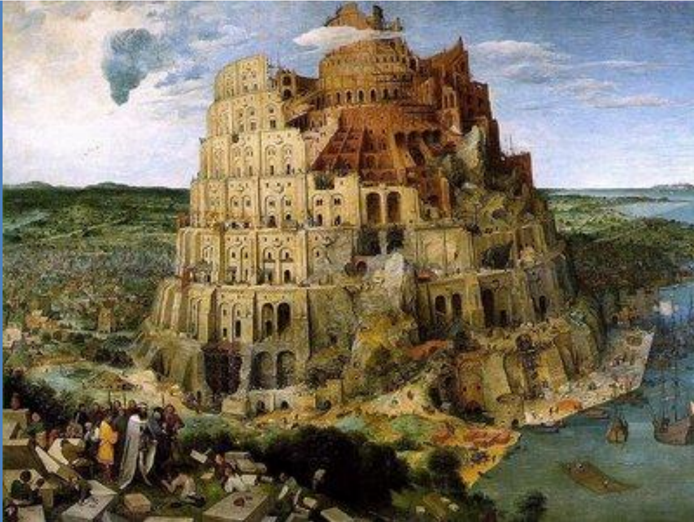
The Tower of Babel - Pieter Bruegel the Elder (c. 1563)