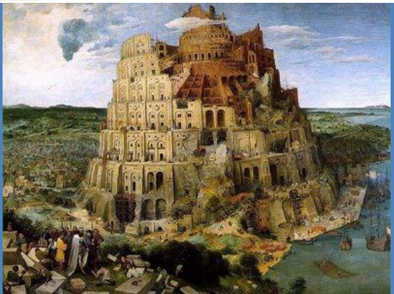
The Tower of Babel - Pieter Bruegel the Elder (c. 1563)